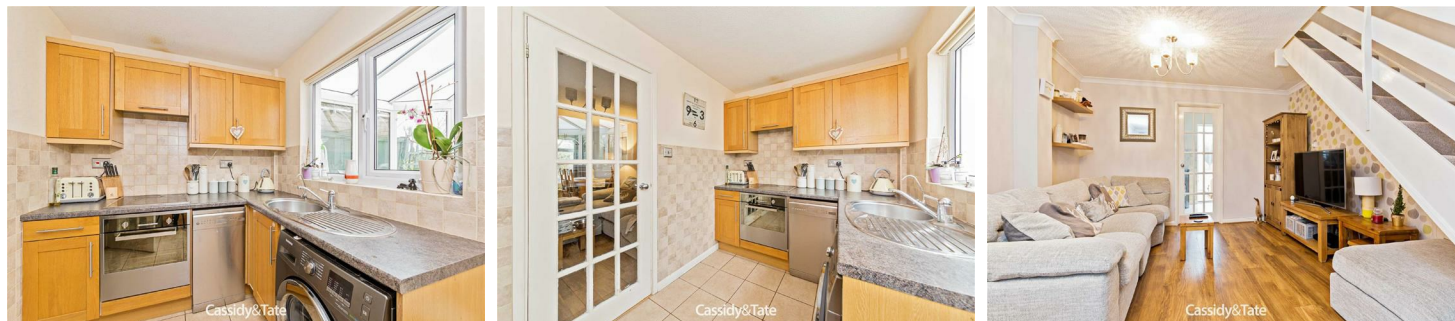
Ground Floor Approx. 407.1 sq. feet

Versatile and low maintenance best describes this two double bedroom, mid terrace family home where deceptive generous proportions and a contemporary ambience is clearly quite evident throughout. A stylish interior creates light and bright living spaces including a well proportioned lounge/diner, a kitchen fitted with modern units and a dining area soaked with natural light. On the first floor are two generous sized bedrooms served by a modern family bathroom. Externally the property features an attractive landscaped rear garden and has the added benefit of one allocated parking space. Harness Way can be found nestled in a cul de sac location within the ever popular Jersey Farm residential development, close to good local amenities including a 'Tesco' metro and a doctor and dentist surgeries, as well as a number of highly regarded schools. St. Albans city centre with its extensive range of shopping and leisure facilities and the mainline railway station remain a short distance away.